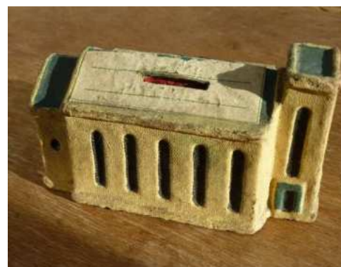
Crowdfunding 1940's style!

A Building Fund had been started and a fundraising event included a social at Horndon-on-the Hill. Moves were also made to improve the band and arrange musical services. Three dozen 'Building Fund' boxes were obtained and these would be kept in the homes of members of the congregation for small change. In July 1943 the building fund reached £43 rising to £72 by September.