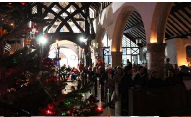
Carols by Candlelight - An old favourite returned to Horndon this year, Lessons and Carols with the addition of candles.