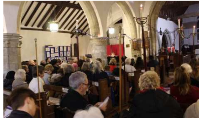
Christmas Eve Family Carols - The Family Carol service at Orsett proved as popular as ever.